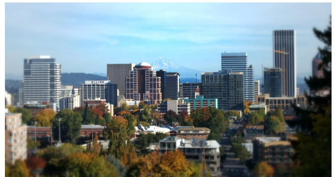
City view Portland

Portland, Oregon is widely recognized for its commitment to sustainability and progressive land use planning, which will allow for quick access to outdoor recreation and opportunities to engage with the rich cultural and historical dimensions of the Pacific Northwest landscape.